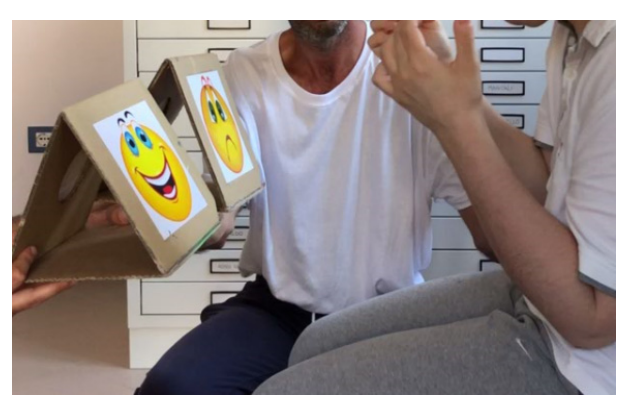
Figure 1. Feeling charts

Each session was facilitated by one art therapist and two Major Degree Psychology students. Sessions were adapted to each individual's level of cognitive and physical ability and were structured in the following three segments: warm-up activity, digital art therapy intervention and closure activity. Each session started with a check-in feeling chart and closed with a check-out feeling chart (Figure 1).