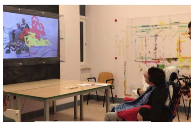
Figure 4. Immersion in the client's drawing.